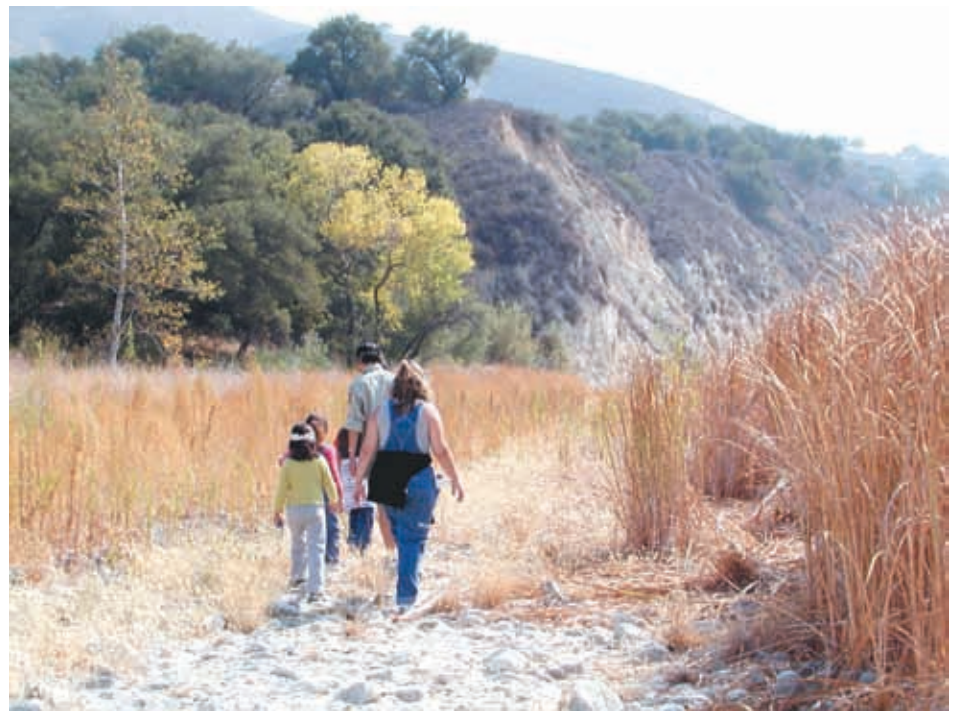
life are all good actions. Can you think of any other ways that we can help take care of our wild lands and their plants and animals?

These fun and educational outings are great ways to learn how to care for nature while enjoying it. Not littering, leaving campgrounds cleaner than you found them, putting out your campfire, staying on trails, and not disturbing wild-